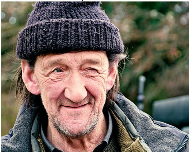
Fuji F125 Kodak 2393